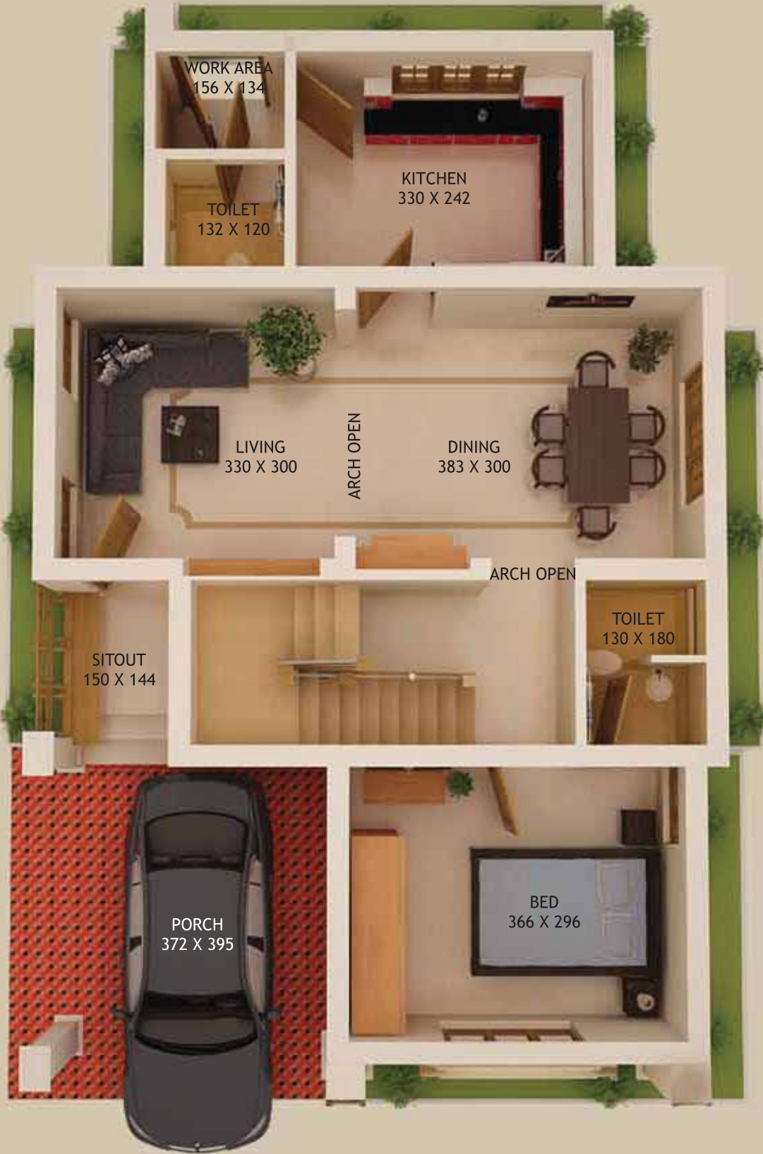
Ground Floor Plan First Floor Plan Total Area