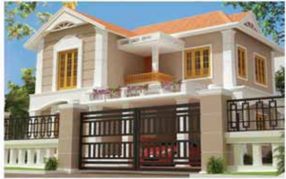
NANDANAM PARADISE APARTMENTS & VILLAS - THRISSUR