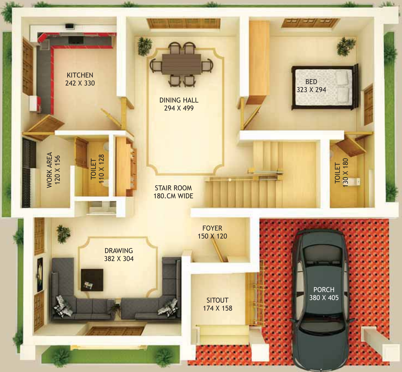
Ground Floor Plan First Floor Plan Total Area